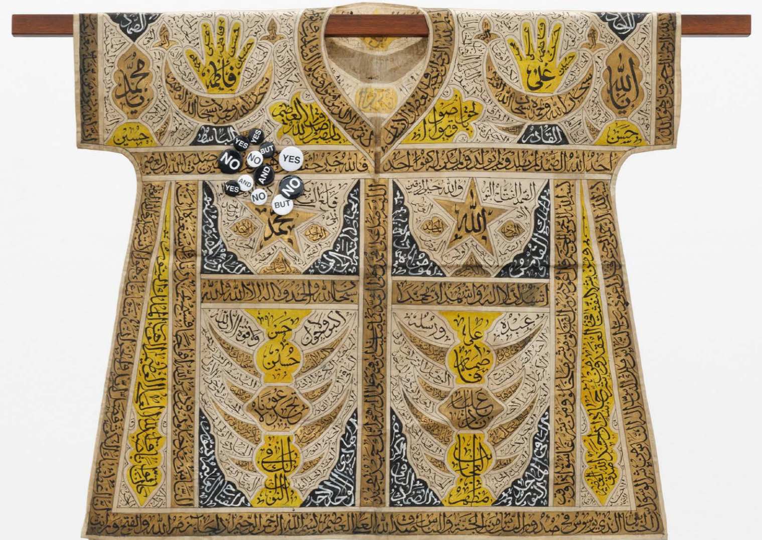
Anahita Razmi. Talismanic Polarities #03. 2026. Islamic talismanic shirt and metal buttons. 80 x 90 cm.

symbol is immediately recognisable – the Nazar Boncuğu, a traditional Turkish amulet placed at thresholds to ward off envy, jealousy and ill intent, normally meant to protect. Here, the motifs are multiplied and shown in various forms across fabric that simultaneously evokes domestic care and the impersonal logic of mass production. In OASIS #1 and OASIS #2 (both 2026), the displacement amplifies Razmi’s ongoing interrogation of significance – protection becomes pattern, rituals become ornament and cultural significance is refracted through both