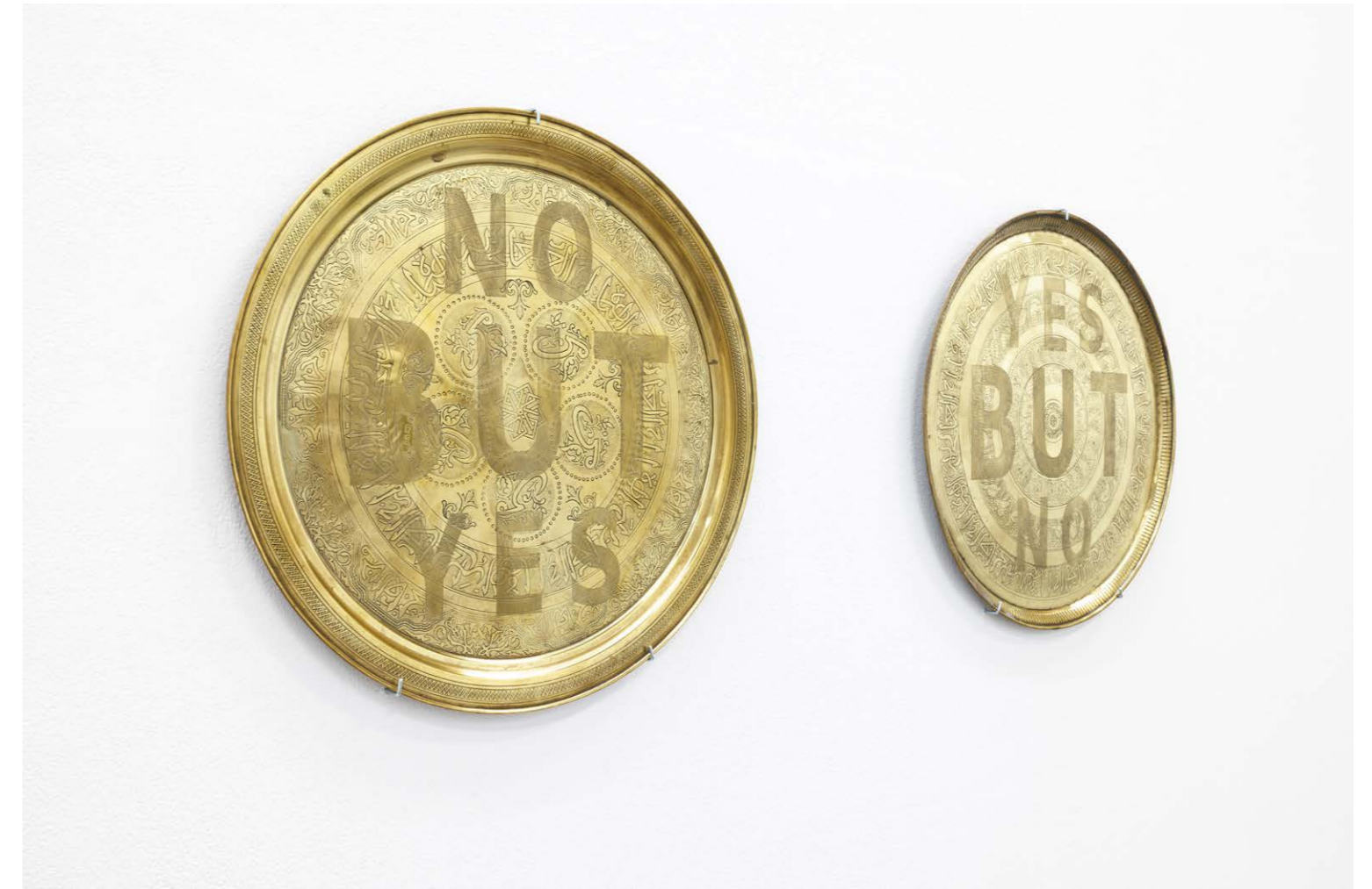
Anahita Razmi. Installation view from The Task of the Mythologist at Carbon 12, 2026.

illusion, recalling the way in which thoughts or memories process and recombine themselves. Some linguistic elements draw on Qur'anic phrasing, and while these reconfigurations are part of the artistic exploration, the engagements with sacred texts may be sensitive for some viewers. In this dialogue between physical and digital, textural and talismanic, there is an emphasis on incompleteness, uncertainty and openness. It complicates the notion of authenticity and presence. Fragmented and animated, they suggest that meaning is not fixed to materiality but circulates through perception and meditation.