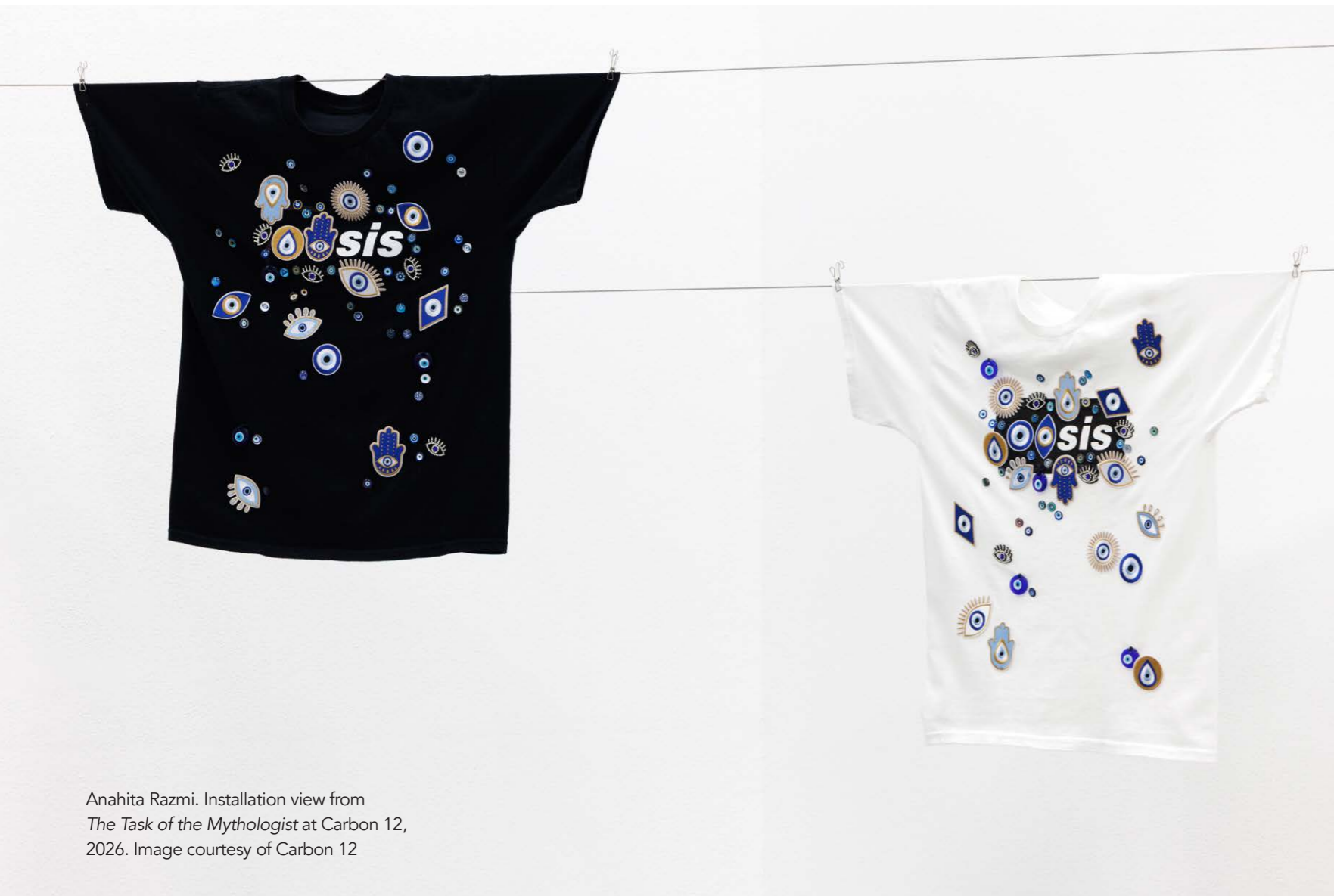
Anahita Razmi. Installation view from The Task of the Mythologist at Carbon 12, 2026.

repetition and context. By overlaying the evil eye on Oasis band T-shirts, Razmi creates a tension between 1990s rock mythology and Eastern protective symbolism.