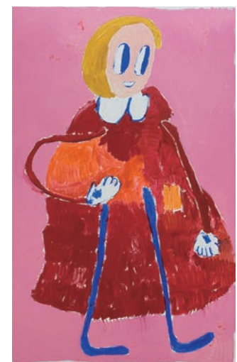
André Butzer, Untitled , 2018