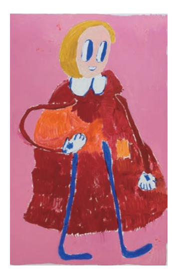
André Butzer, Untitled, 2018