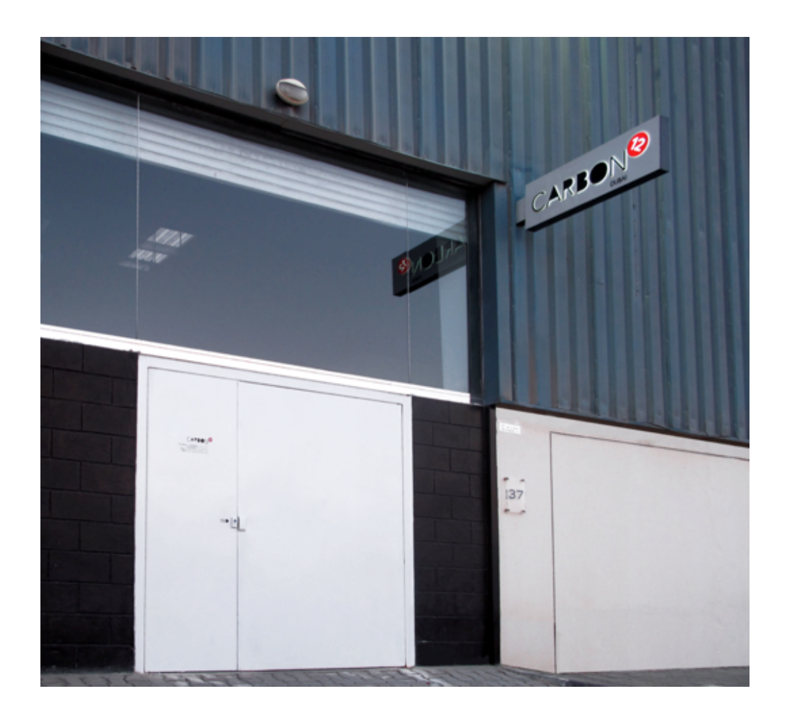
Good Ideas: 'The Pretenders' runs at Carbon 12 on Alserkal Avenue through 28 October. For details go here.

BB: It's the stereotype of an artist's studio. It's a big space in an 18th century factory. I keep a guitar there and play it badly while I'm waiting for layers of paint to dry or puzzling over where to go next with a painting. I keep regular hours from 9 or 10 in the morning until 6 in the evening and then close the door.